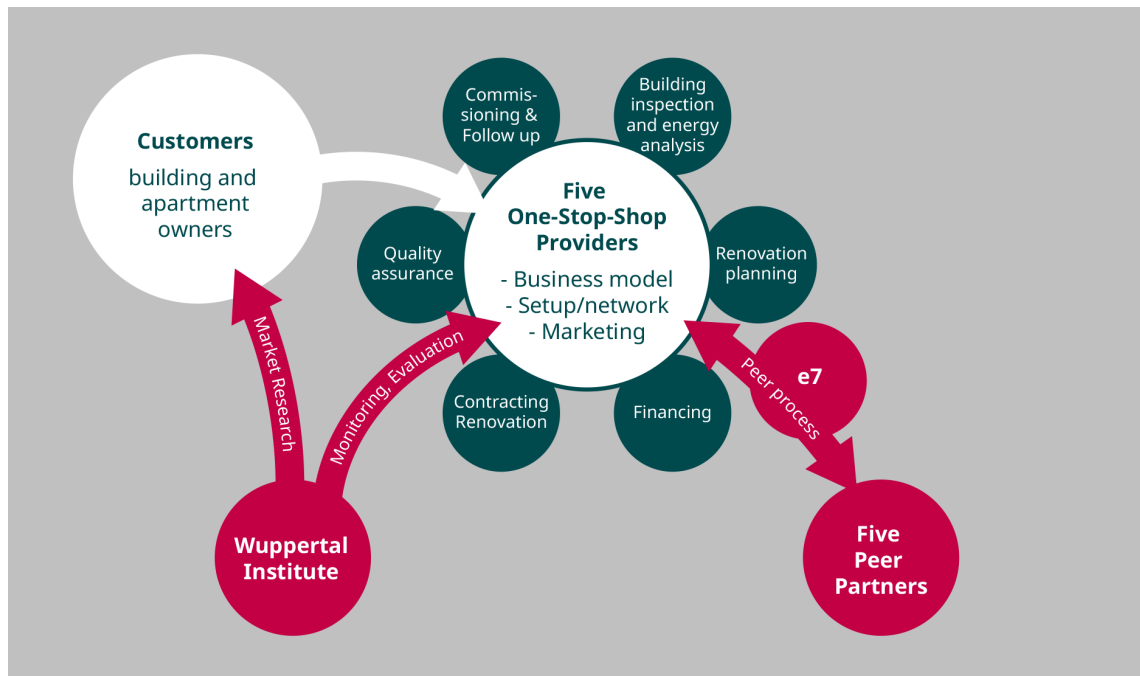
Figure 1: Structure of the ProRetro project

The German project partners are regional energy agencies and small and medium enterprises. They have developed and implemented individual One-Stop-Shop models based on their existing experience, target groups and networks, i.e., the aim of ProRetro was not to develop a one-size-fits-it-all model.